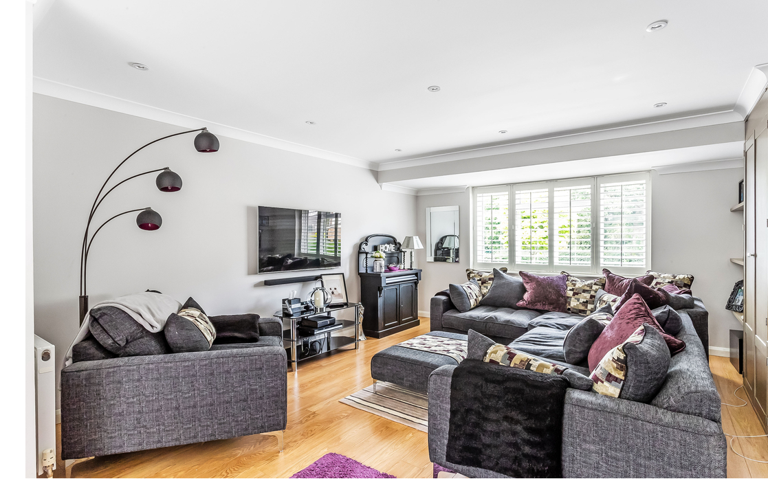
9 Mill Shaw, Oxted, Surrey RH8 9DQ £1,165,000 - Freehold