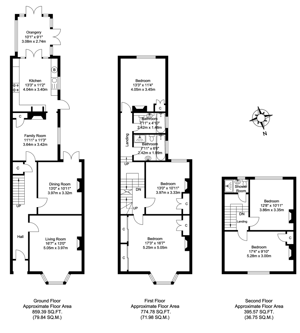
TOTAL APPROX FLOOR AREA 2029.75 SQ. FT / 188.57 SQ. M For Identification Purposes Only.