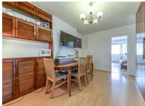
Windermere Road, London, SW16