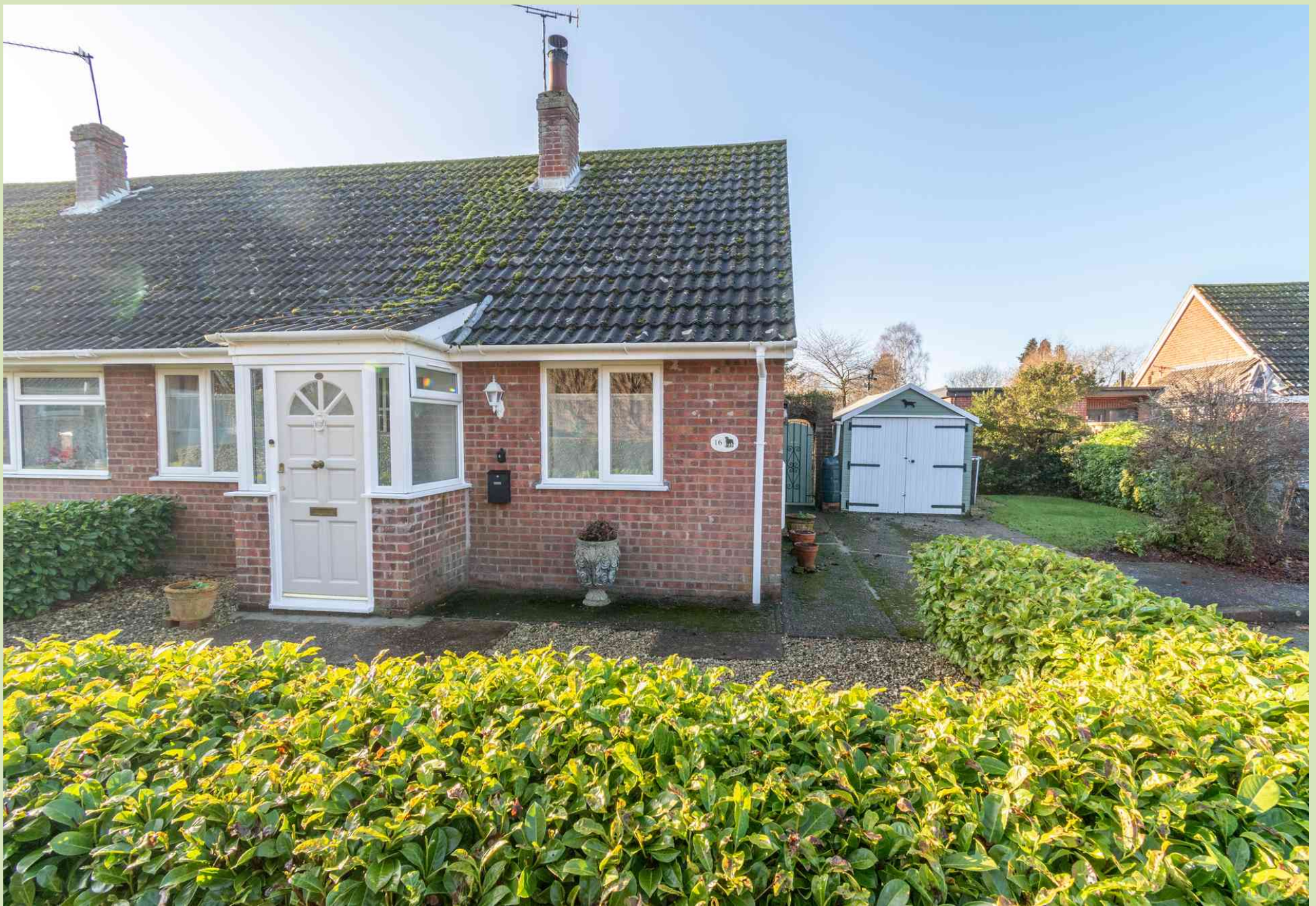
16 Peakhall Road, Tittleshall Guide Price £215,000