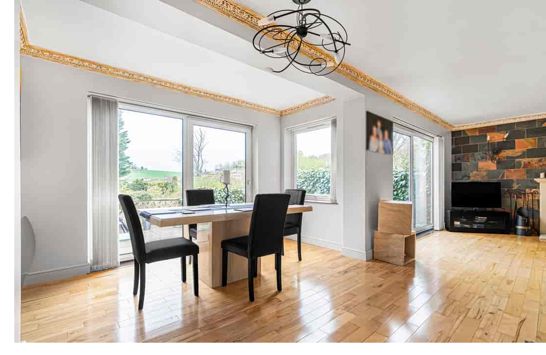
Longreach, Goodwood Rise, Marlow, Buckinghamshire SL7 3QE Guide Price £795,000 - Freehold