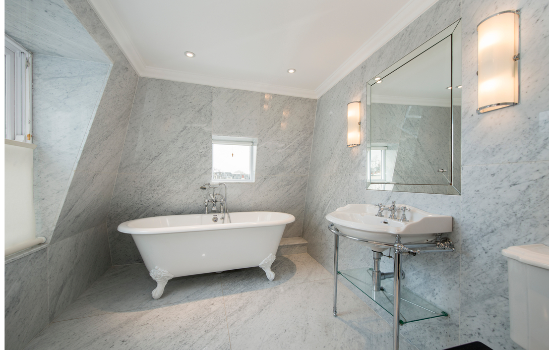
Flat 6, 22 Eaton Square, Belgravia, London, SW1W 9DE £900,000 - Leasehold