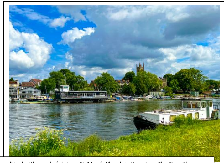
The property is within Hurst Park and very close to Hurst Park Meadows (Ideal for walking) with wonderful views St. Mary's Church in Hampton. The River Thames towpath leads up to Hampton Court with its Palace, restaurants, cafes, bars and train station – Ideal for commuter into London, Waterloo – Zone 6, Oyster Card