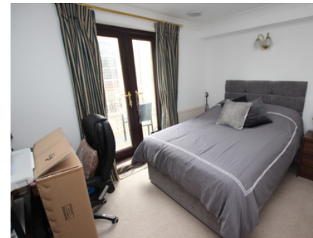
2 Chapel Court, Langford, Bedfordshire, SG18 9JS