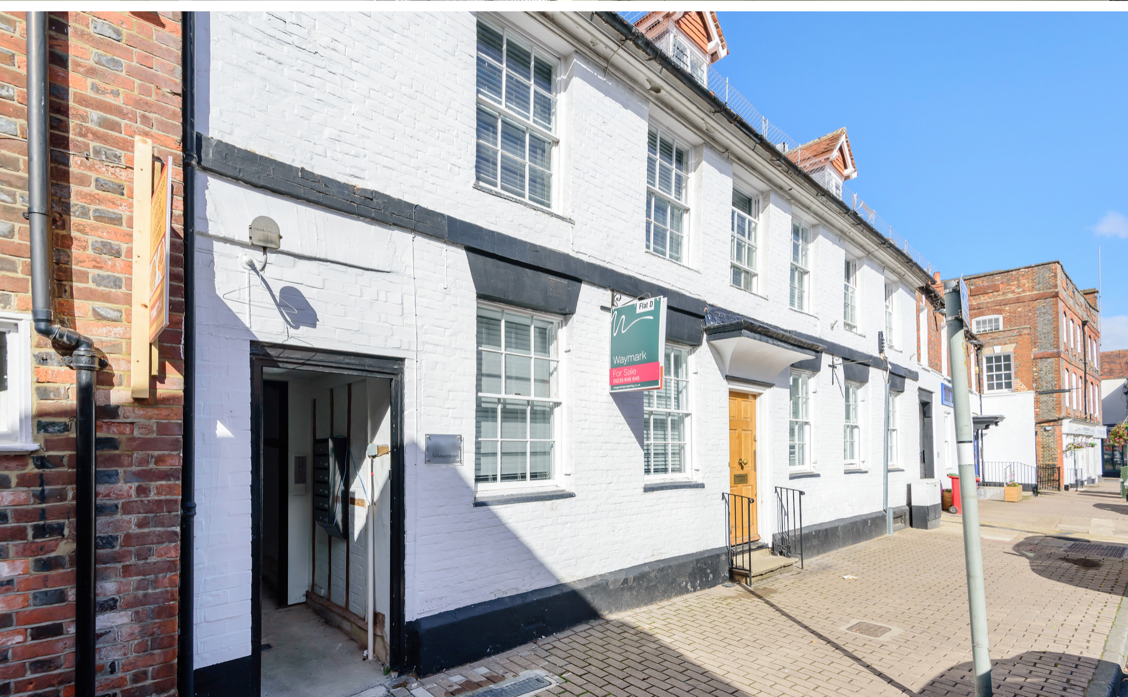
Flat B, 6 Newbury Street, Wantage OX12 8BS Oxfordshire, £138,500