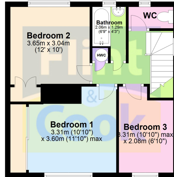
Total area: approx. 82.2 sq. metres (885.1 sq. feet)

This plan is for illustrative purposes only Plan produced using PlanUp.