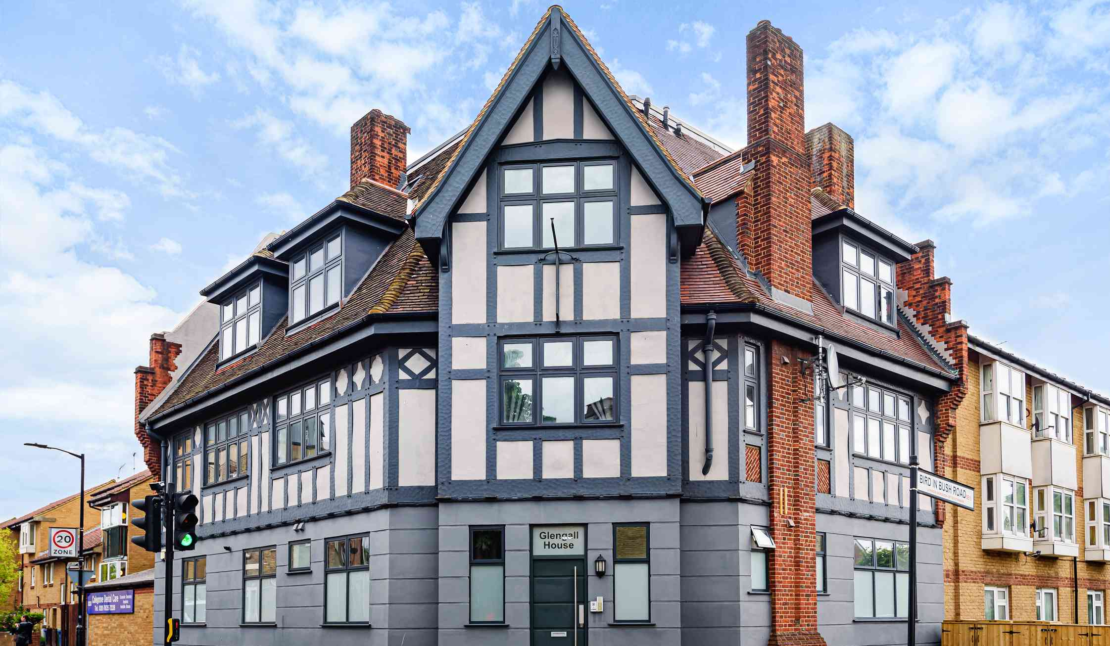
Bird in Bush Road, London, SE15 6RN