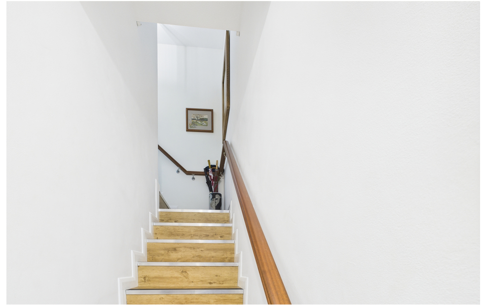
Meadow Court, Bridge Street, Belper, Derbyshire DE56 1HE £170,000 - Leasehold