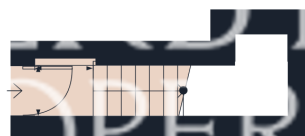
Hallway 0.88 x 0.92 m 2'10" x 3'0"