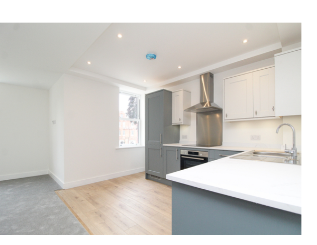
PLEASE NOTE: The measurements that have been quoted are approximate and strictly for guidance only. All fittings, fixtures, services and appliances have not been tested and no guarantee can be given that they are in working order. The particulars are believed to be correct but their accuracy is not guaranteed and they do not constitute an offer or formpart of a contract. The images displayed are for information purposes only and it cannot be inferred that any itemshown will be included in the property.