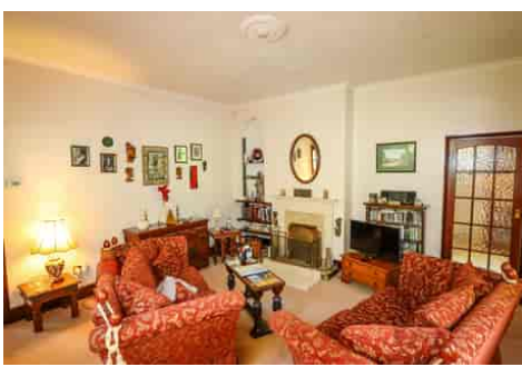
3 Hazel Court Cottages, Stonestile Lane, Hastings TN35 4PF