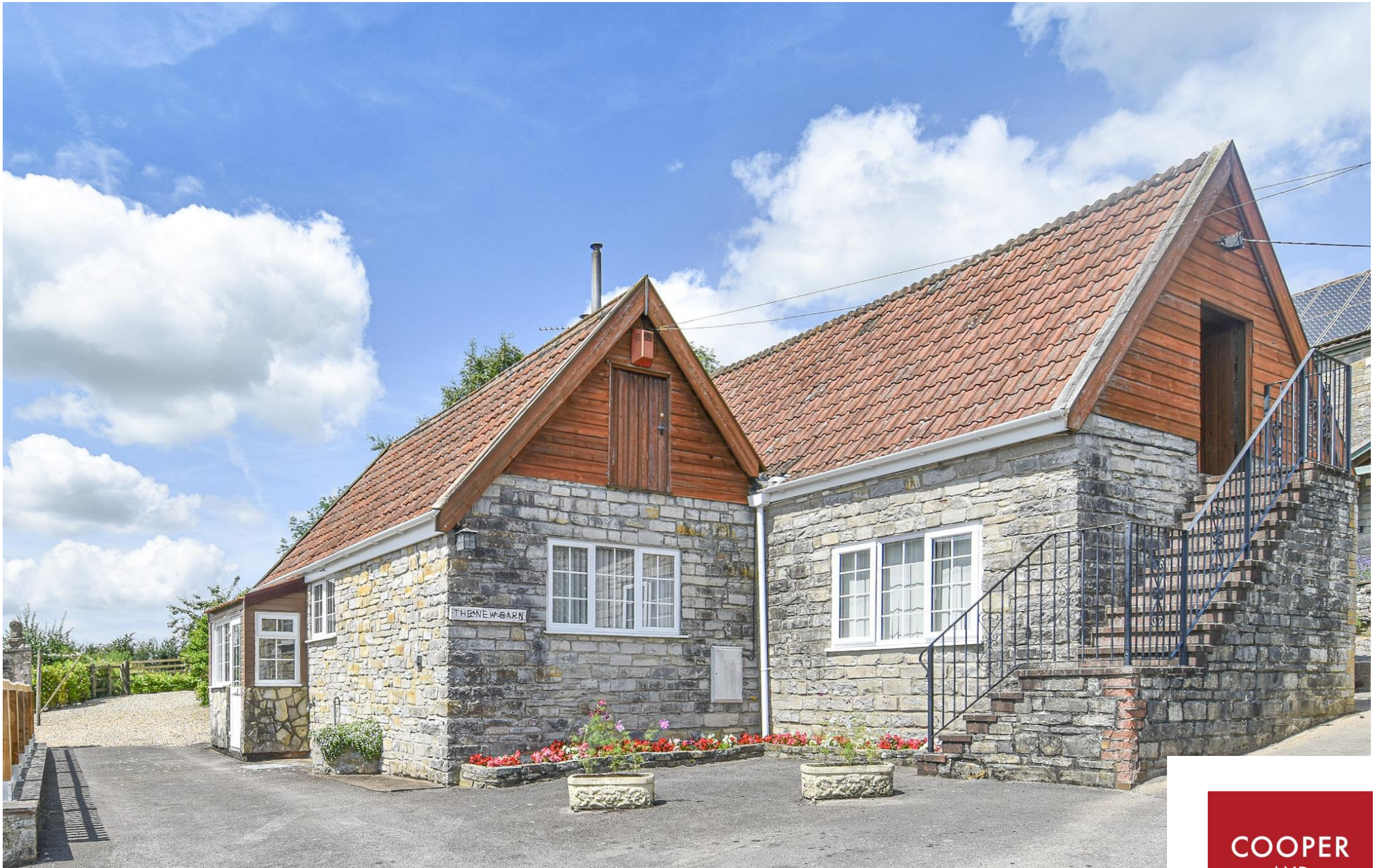
The New Barn, Heath House, Wedmore BS28 4UQ