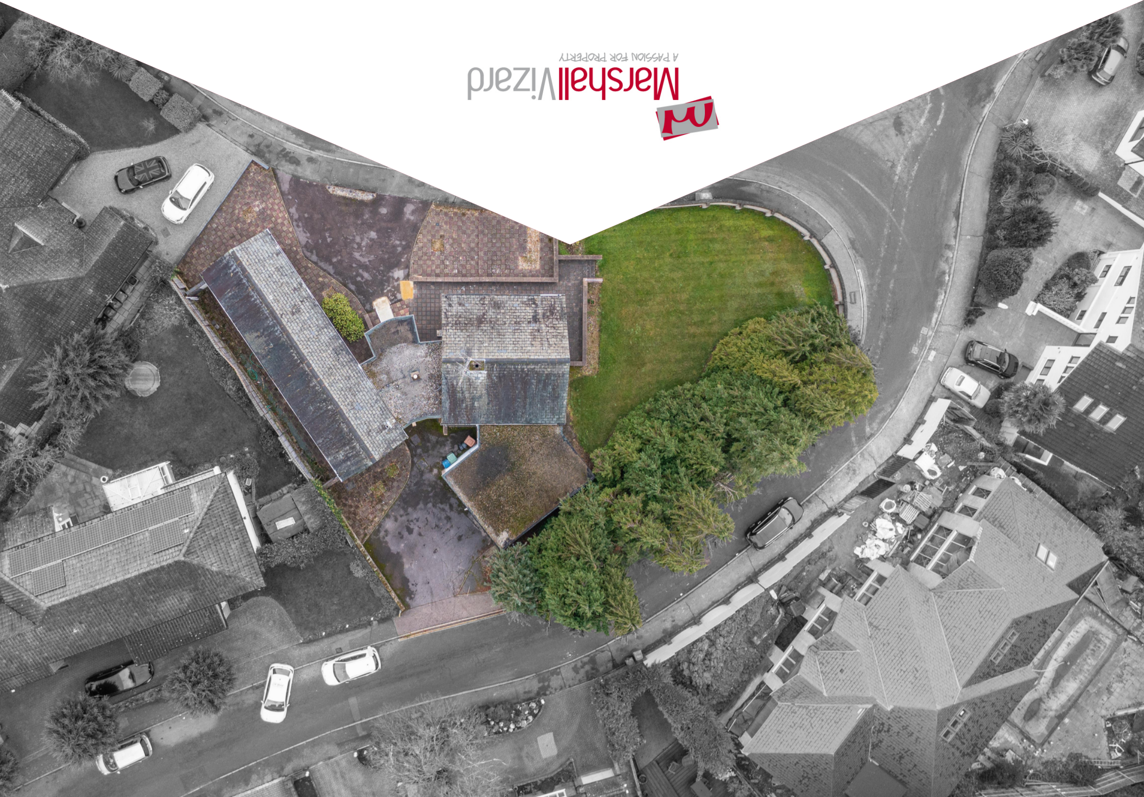
4 BEDROOM DETACHED HOUSE, FALLOWFIELD, STANMORE, HA7 3DF