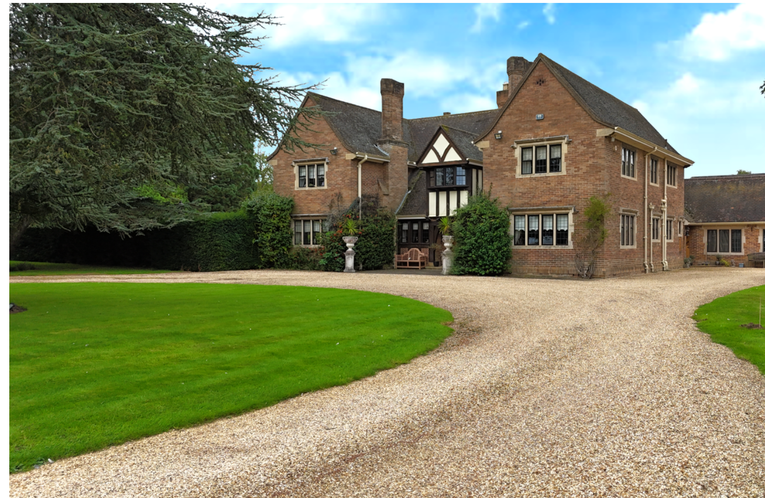
Tudor Lodge, Fen Road, Holbeach PE12 8QD