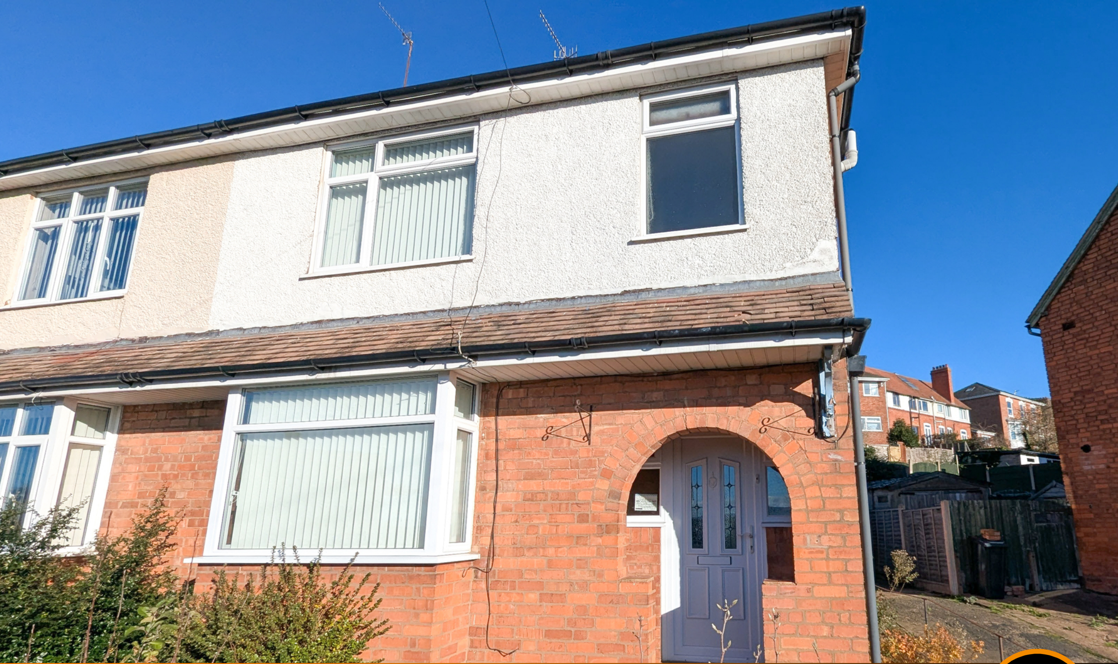
Holly Mount Worcester WR4 9SE