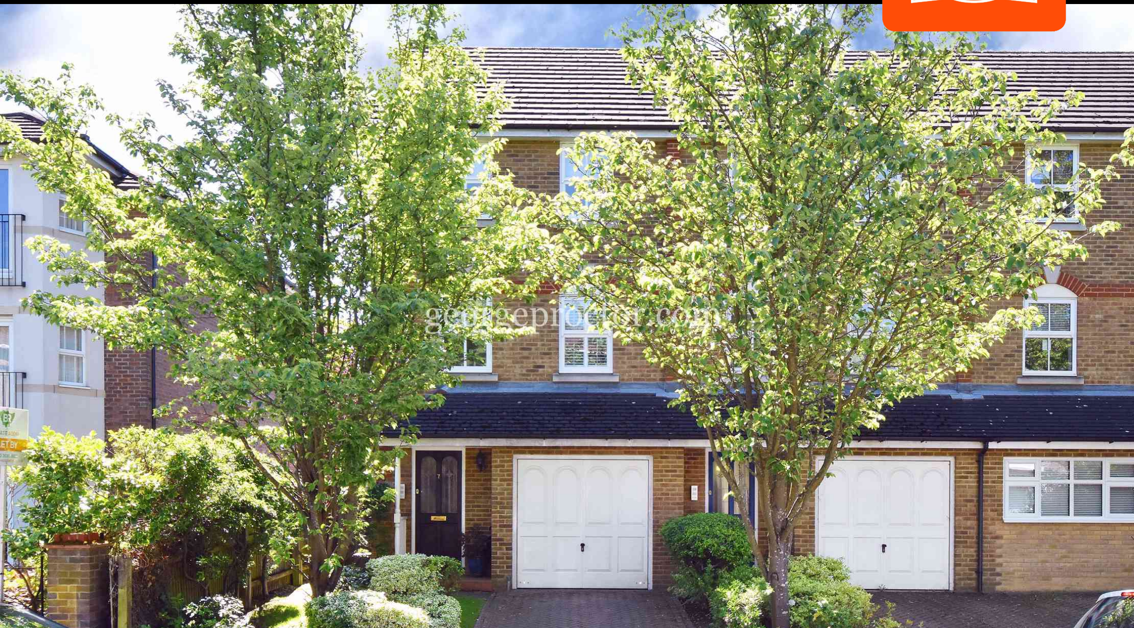
Spencer Road, Bromley, Kent. BR1 3SU