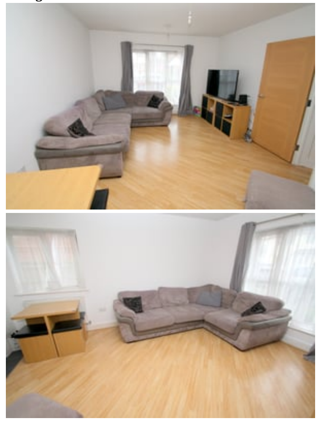
Front and side aspect UPVC double glazed window, light and power points, two radiators, wood-style flooring. Open to: