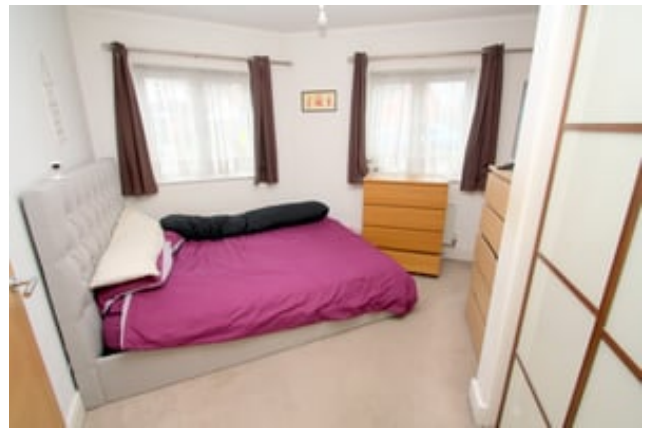
Front aspect UPVC double glazed windows, light and power points, radiator, built-in wardrobes.