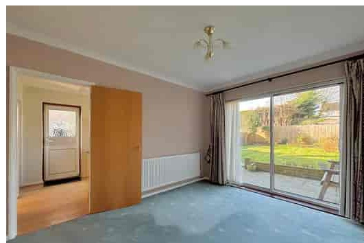
4 Downsvie Close, Swanley, Kent, BR8 7JL Guide Price £400,000 Freehold