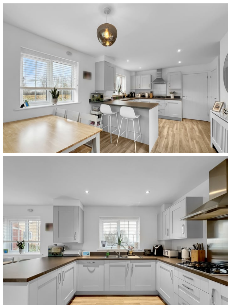
19' 3" x 10' 3" (5.87m x 3.12m)