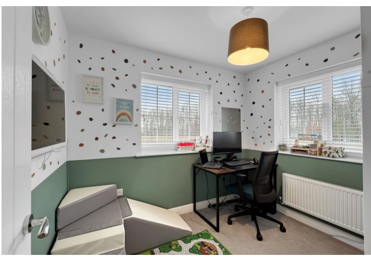
9' 2" x 7' 7" (2.79m x 2.31m)