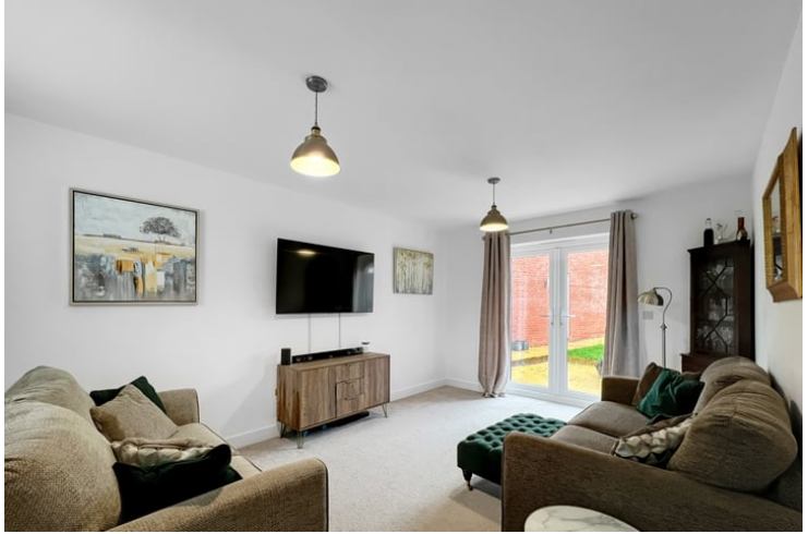
16' 11" x 10' 9" (5.16m x 3.28m)