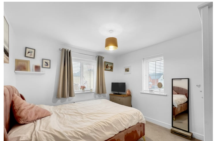
11' 5" x 10' 4" (3.48m x 3.15m)