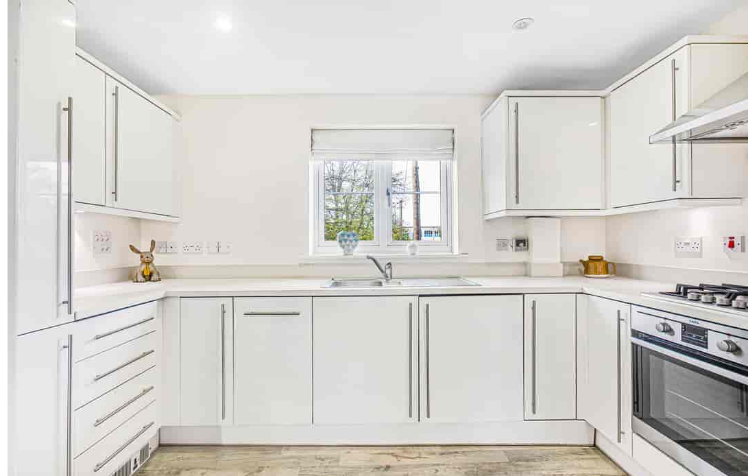
4 Ferris House, Findlay Mews, Marlow, Buckinghamshire SL7 1AP Guide Price £370,000 - Leasehold