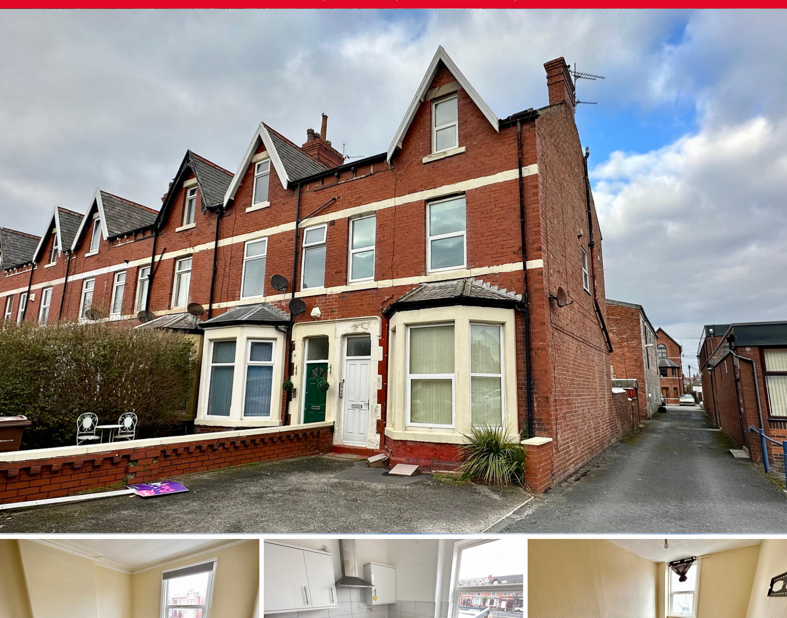
Flat 2, 11 St Patricks Road South, Lytham St Annes, Lancashire, FY8 1UP £525 pcm

e: sales@frankwyles.com | w: www.frankwyles.com