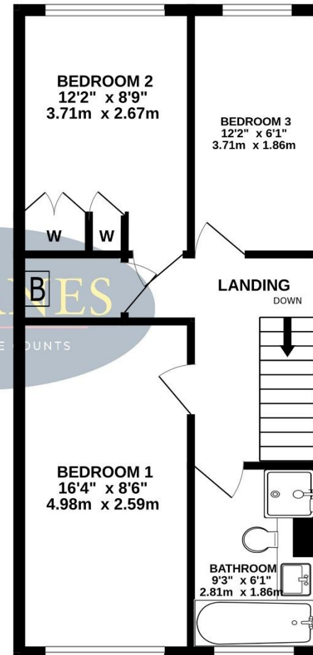
1ST FLOOR 471 sq.ft. (43.8 sq.m.) approx.

TOTAL FLOOR AREA : 1055 sq.ft. (98.0 sq.m.) approx. Whilst every attempt has been made to ensure the accuracy of the floorplan contained here, measurements of doors, windows, rooms and any other items are approximate and no responsibility is taken for any error, omission or mis-statement. This plan is for illustrative purposes only and should be used as such by any prospective purchaser. The services, systems and appliances shown have not been tested and no guarantee as to their operability or efficiency can be given. Made with Metropix ©2026