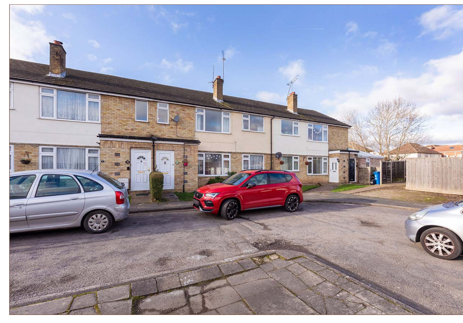
Offered to the market with NO ONWARD CHAIN and in excellent condition

An updated 1st floor two double bedroom maisonette situated in this sought-after location within walking distance of the town centre and Maidenhead station (Paddington/Elizabeth Line). This spacious property features 2 large double bedrooms, modern kitchen with access to private balcony, a generous sitting room, 2 allocated parking spaces, garage with a new roof and a very large private garden.