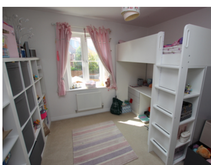
19 Walker Mead, Biggleswade, Bedfordshire, SG18 8GW