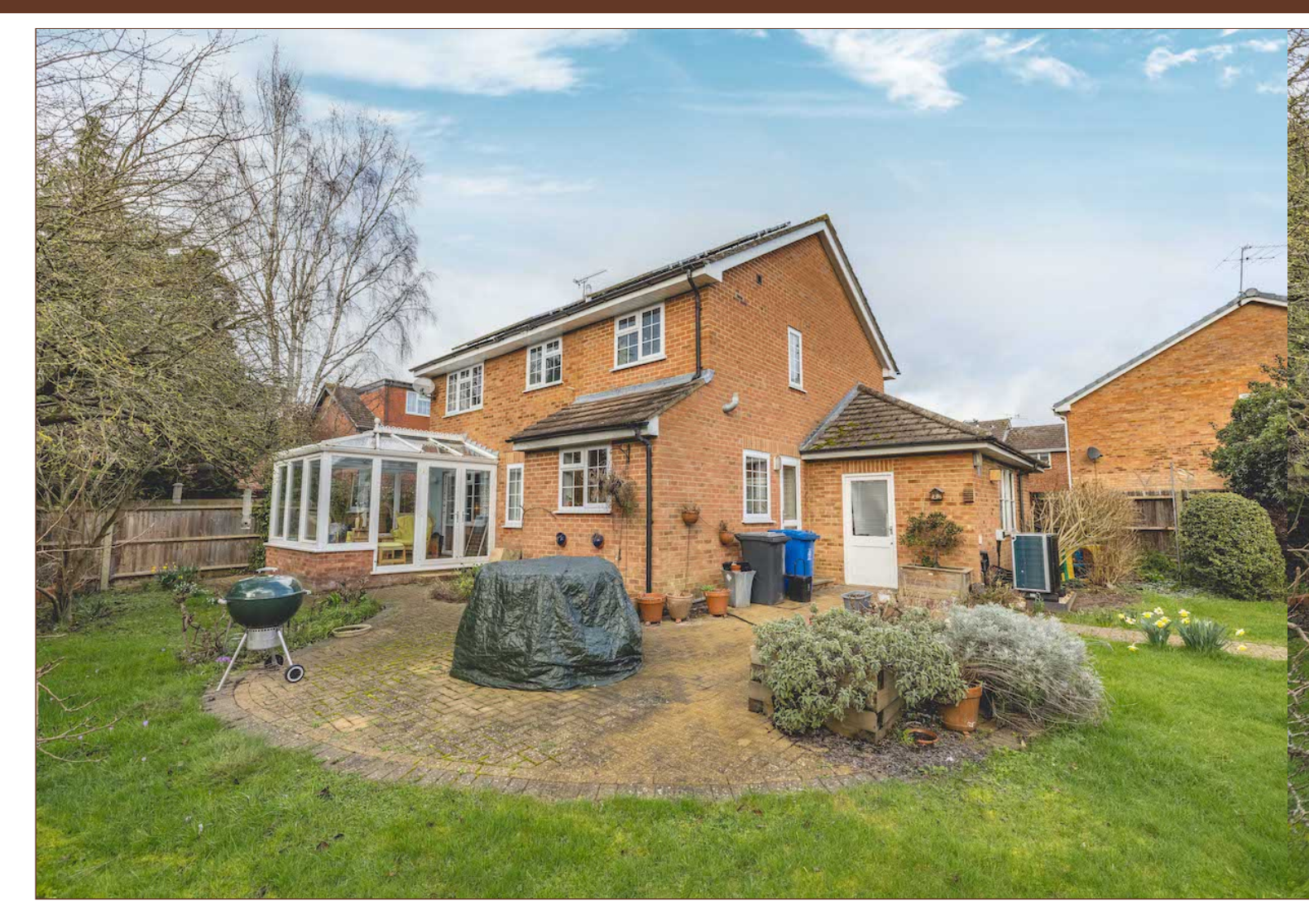
Set in the ever popular Lowbrook School Catchment, this FOUR bedroom detached family home on a corner plot enjoying a sunny, south facing garden. The property further benefits from; three reception rooms, driveway parking and garage with electric door, a garden office/studio, heat pump and solar panels with battery storage.

To the front of the property a driveway, flanked by mature shrubs and planting, leads to the garage and front door. The Hallway gives access to the spacious Dining Room, with bay window overlooking the front, and double doors to the Kitchen. The sunny Kitchen is fitted with a full range of floor and wall mounted units set to ample work top and incorporating a sink unit, large range cooker, fitted appliances and space for a tall fridge freezer. There is a door to garden. Further downstairs reception rooms include a study (currently in use as bedroom 5) and the dual aspect Living Room which leads to the Conservatory and, in turn, the garden.