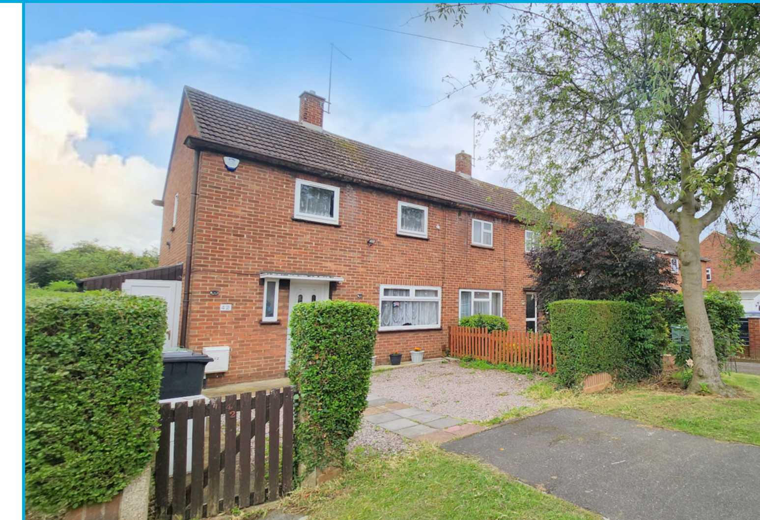
42 MYRTLE AVENUE, PETERBOROUGH, CAMBRIDGESHIRE. PE1 4LR