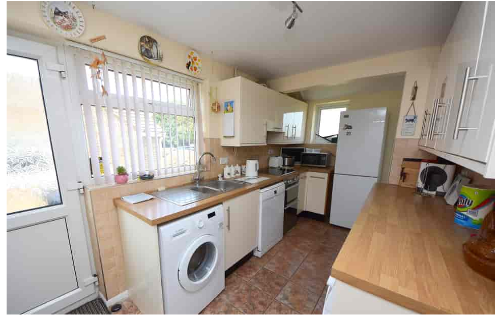
16 Sandringham Road, Kings Sutton, Banbury, Northamptonshire. OX17 3QS Guide Price £297,000 - Freehold