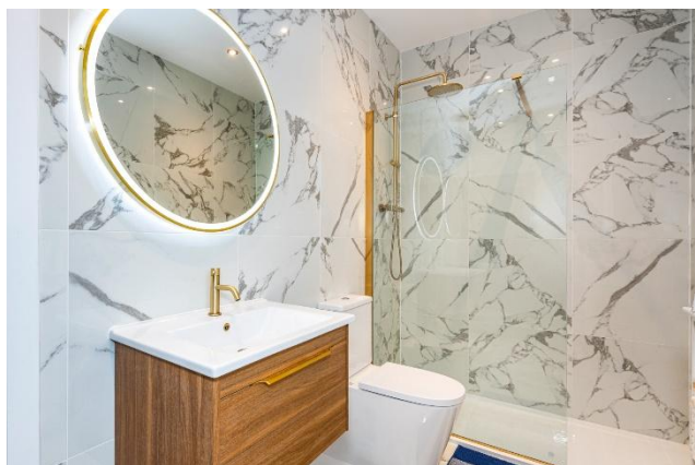
BEDROOM 1 EN-SUITE SHOWER ROOM

EN-SUITE SHOWER ROOM (11'3 x 5'4) Glamorous fully tiled shower room comprising floating vanity unit with illuminated mirror, WC and enclosed shower unit. Heated towel rail, ceiling spotlights and UPVC double glazed window to the rear.