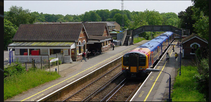
Frimley Railway Station