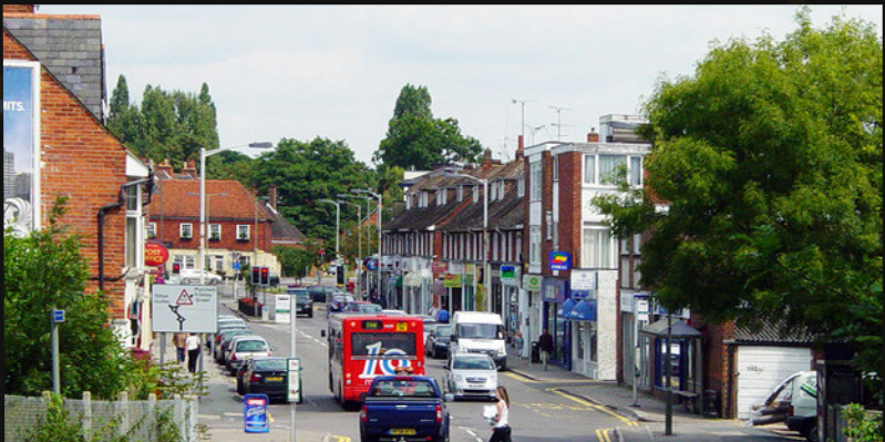
Frimley High Street