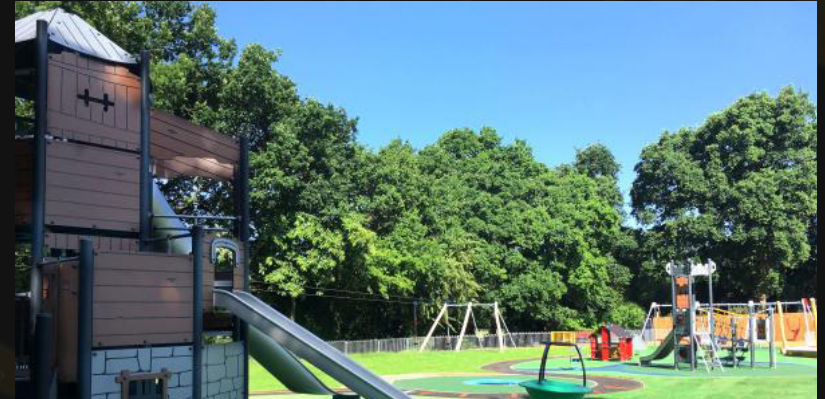
Frimley Lodge Park