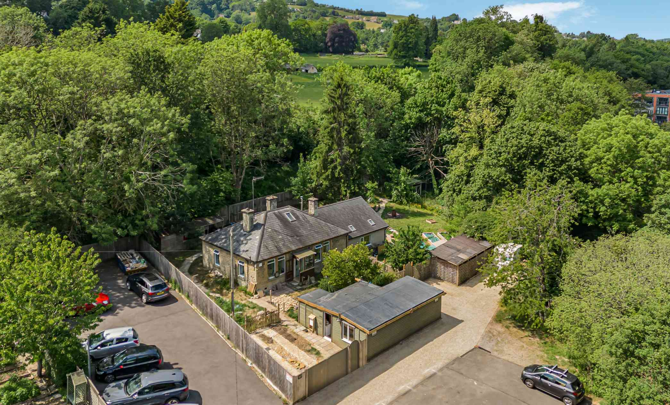
Elfwood House, Selsley Road, North Woodchester, Stroud, GL5 5NN Price guide £625,000