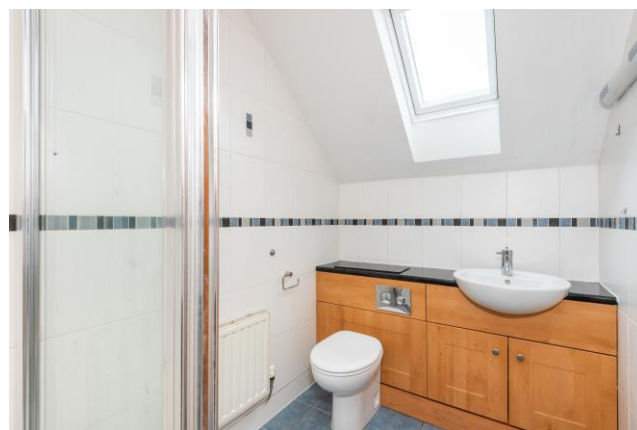
EN-SUITE SHOWER ROOM 2

BEDROOM 3 (14'9 x 11') UPVC double glazed windows to side and rear, radiator and loft access.