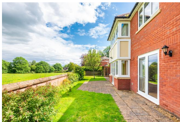
REAR OF THE PROPERTY

TENURE We are informed the tenure is Leasehold.