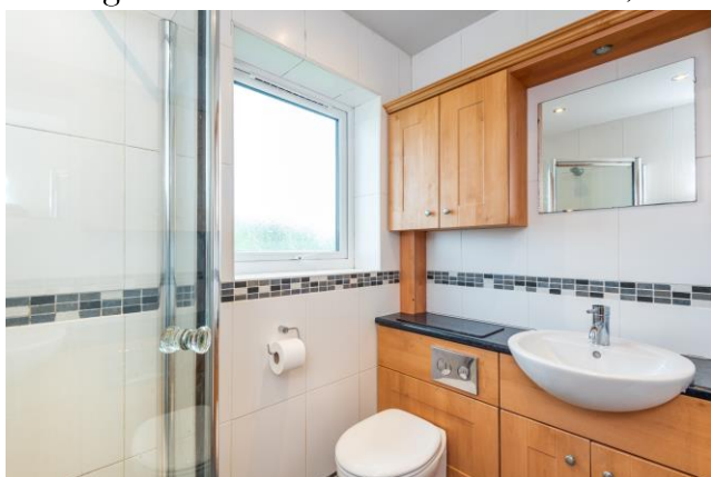
EN-SUITE SHOWER ROOM 1

EN-SUITE SHOWER ROOM (7' x 5') Fully tiled three piece suite comprising walk-in shower, WC with concealed cistern and wash hand basin with tiled splashback. UPVC double glazed frosted window to the side, heated towel rail and panelled ceiling.