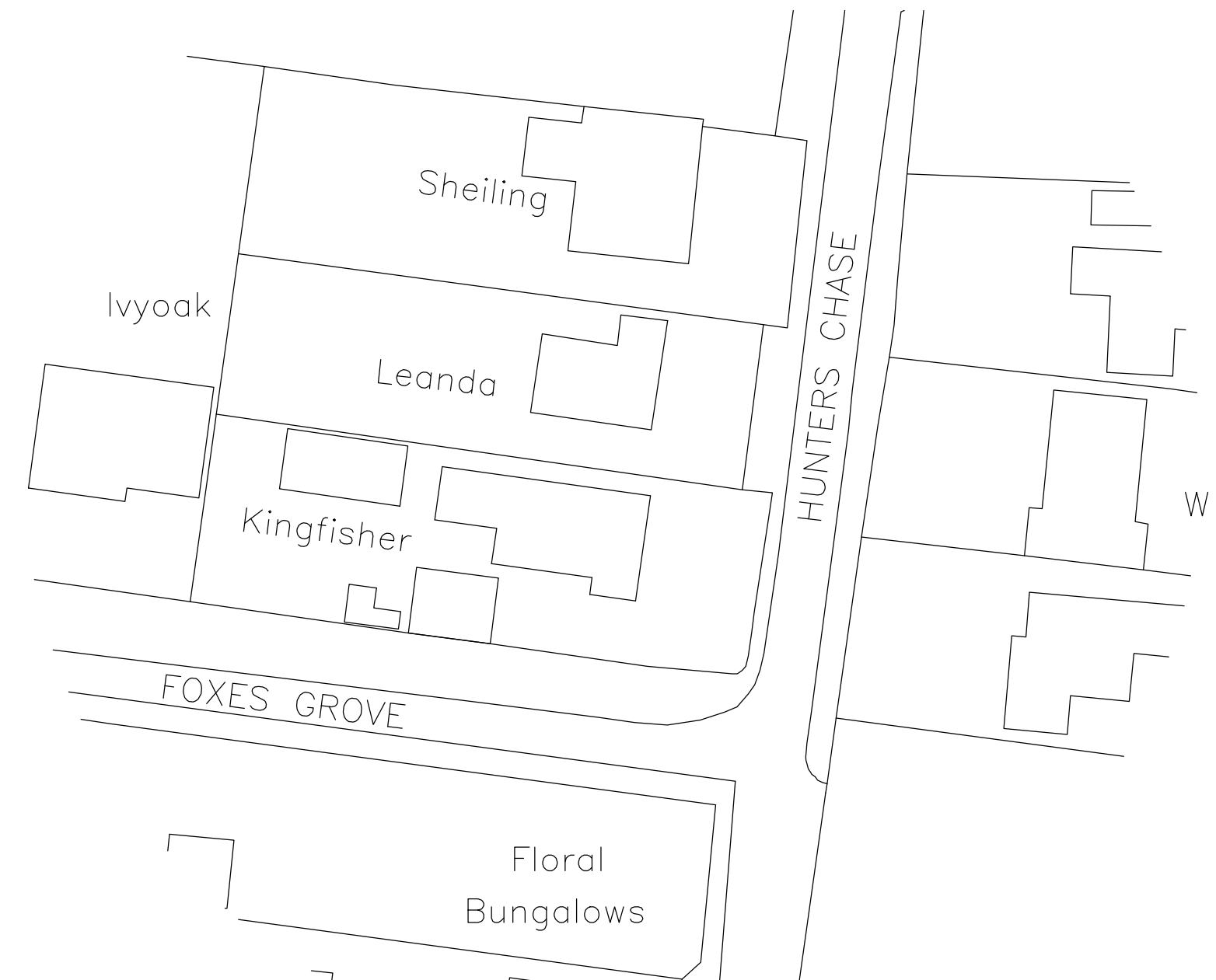
Existing Block Plan 1:500