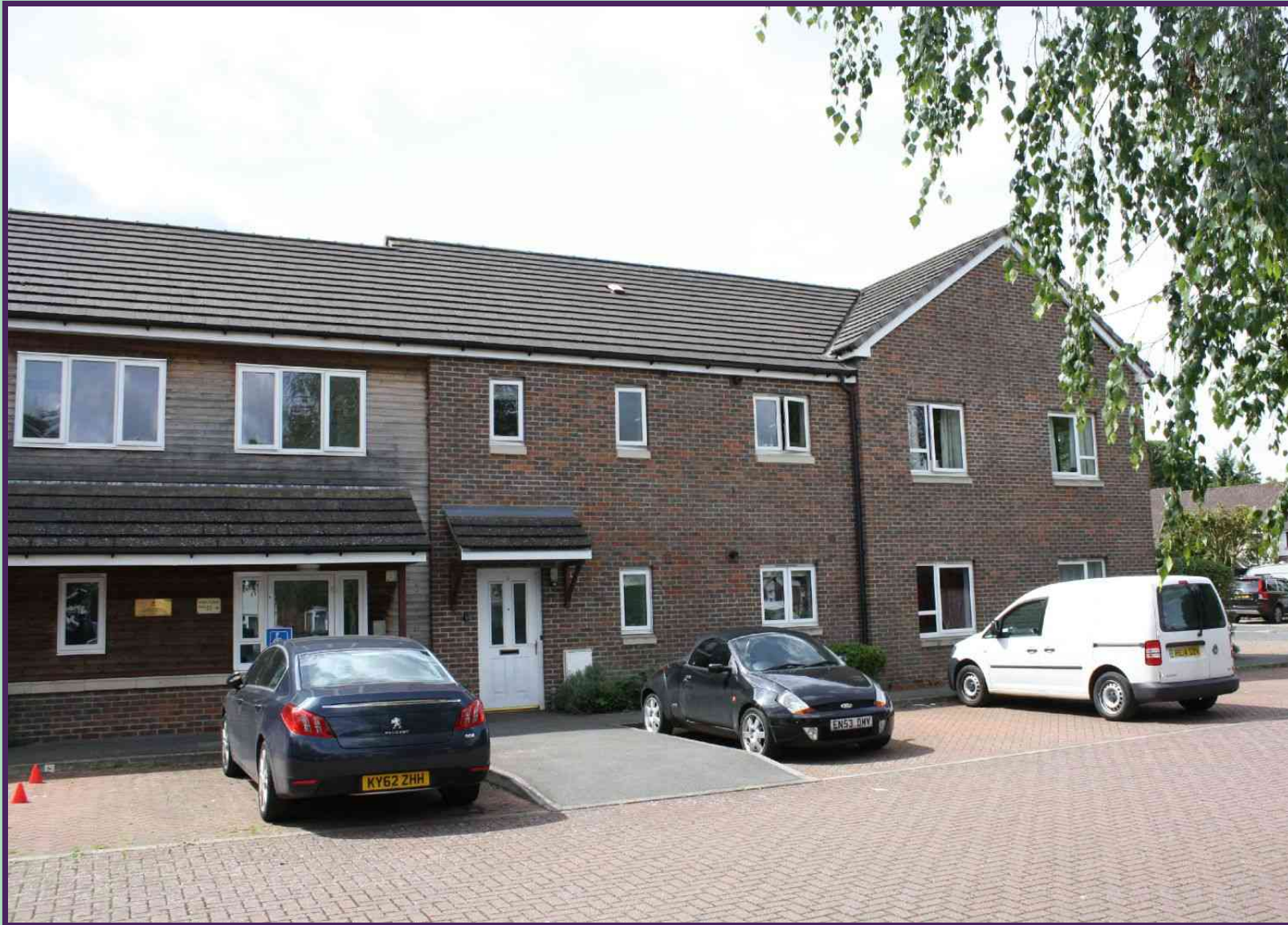
Flat 6, Ellwood Place Cordons Close, Chalfont St Peter, Buckinghamshire. SL9 9TW.