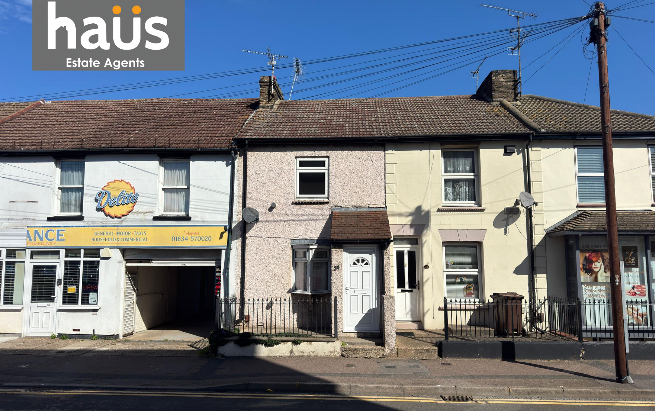
Two Bedroom Terraced House Jeffery Street, Gillingham, Kent, ME7 1DE