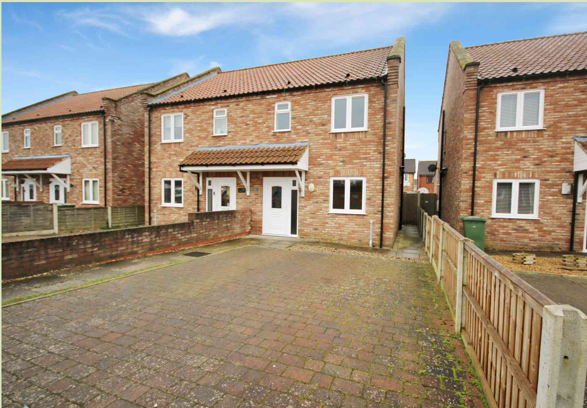
47 Spenser Road, King's Lynn Offers in Excess of £230,000