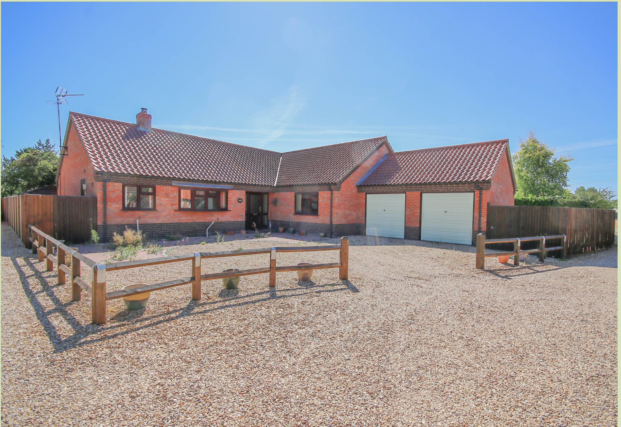
12d Chequers Lane, North Runcton Guide Price £450,000