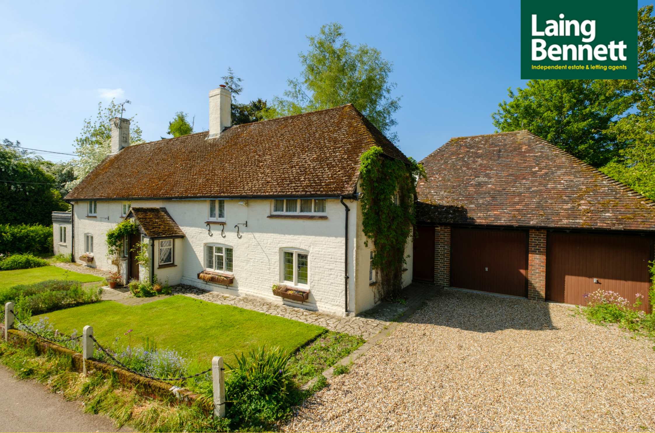
Pilgrims Cottage, Church Lane, Kingston, Canterbury, Kent, CT4 6HX