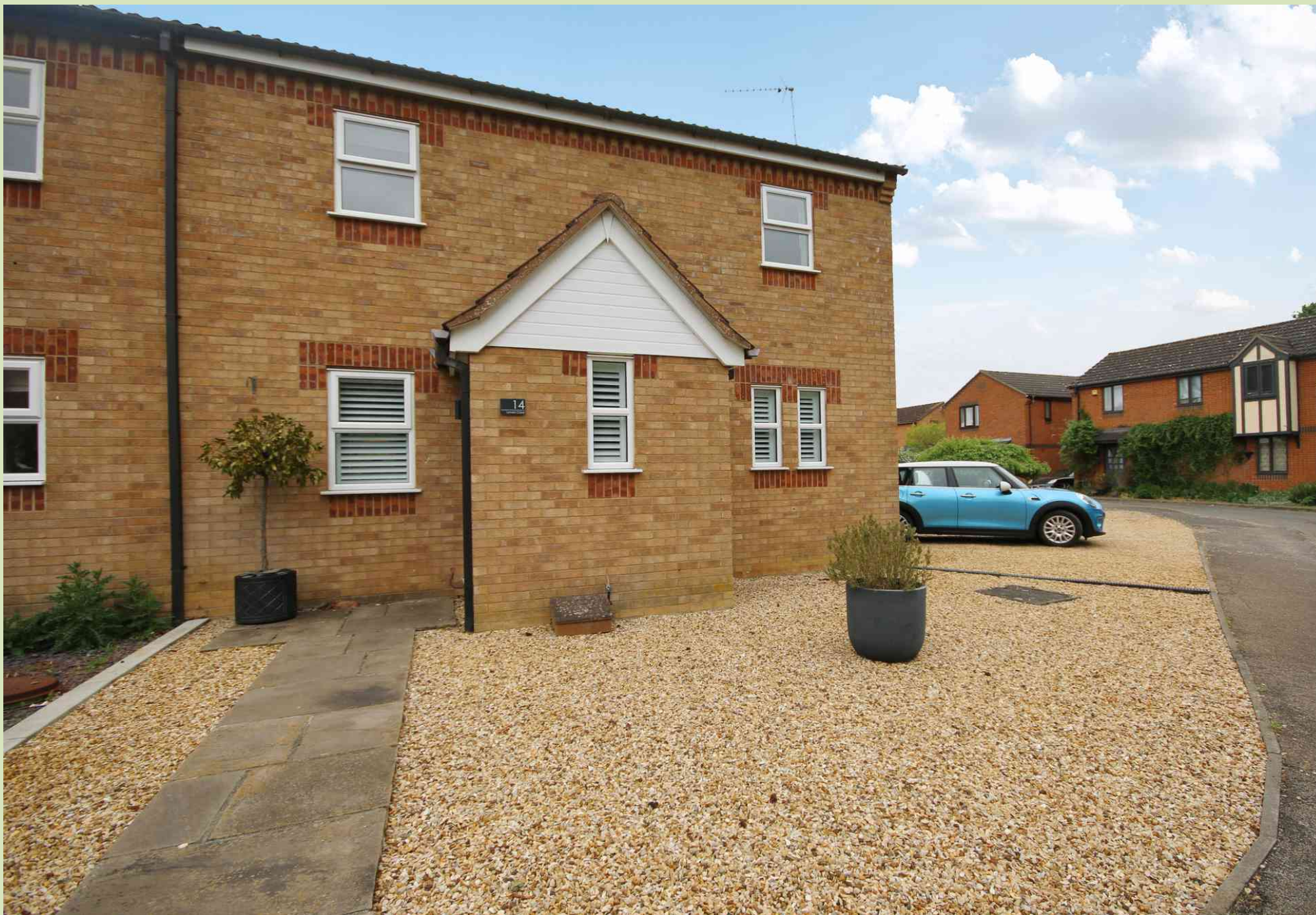
14 Levers Close, King's Lynn Guide Price £255,000