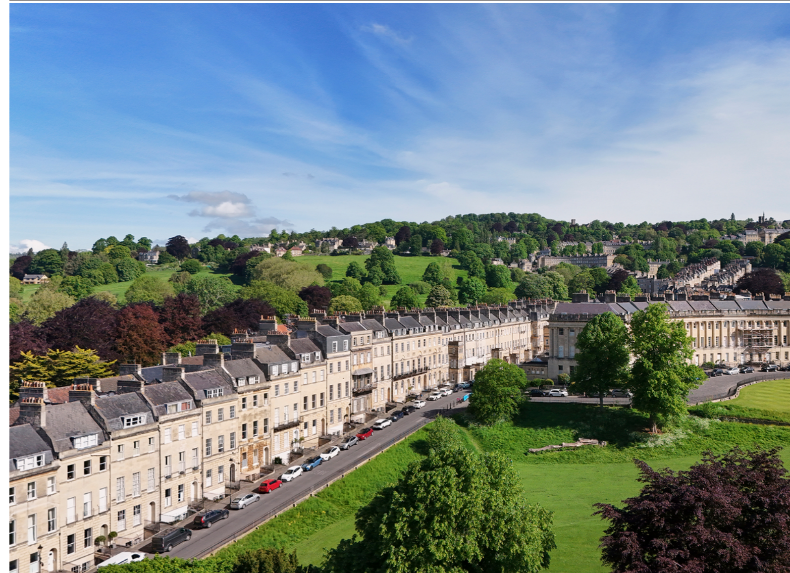
Marlborough Buildings, Bath