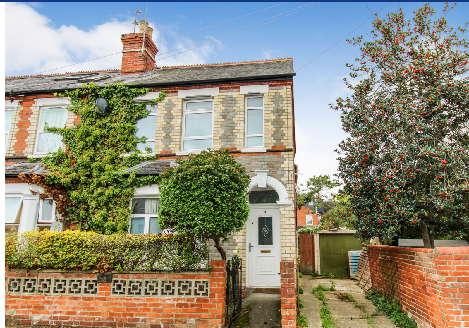
4 Bishops Road, Reading, Berkshire. RG6 1NP.