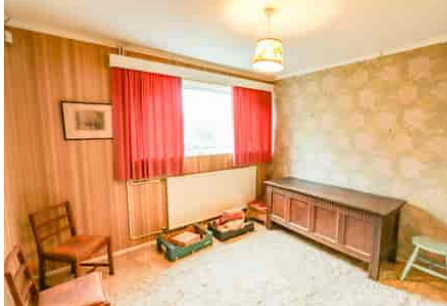
Flat 3 Avondale Court Avondale Road, St Leonards-on-Sea, East Sussex TN38 0SB