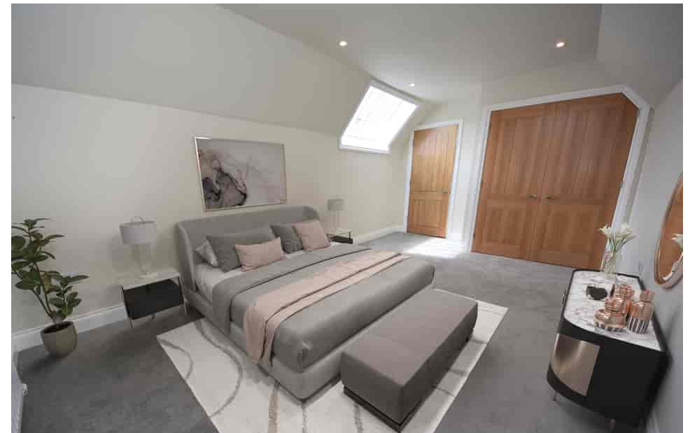
2 The Old Elephant & Castle, Causeway, Banbury, Oxfordshire. OX16 4SN Guide Price £265,000 - Freehold