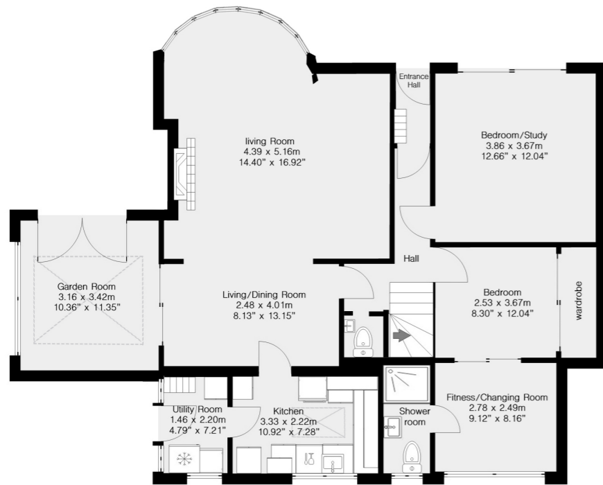
Ground Floor approx : 90.3m 2 - 972 sqft