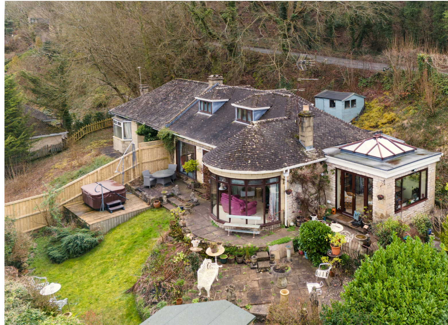
Kingsdown, Nr Bath