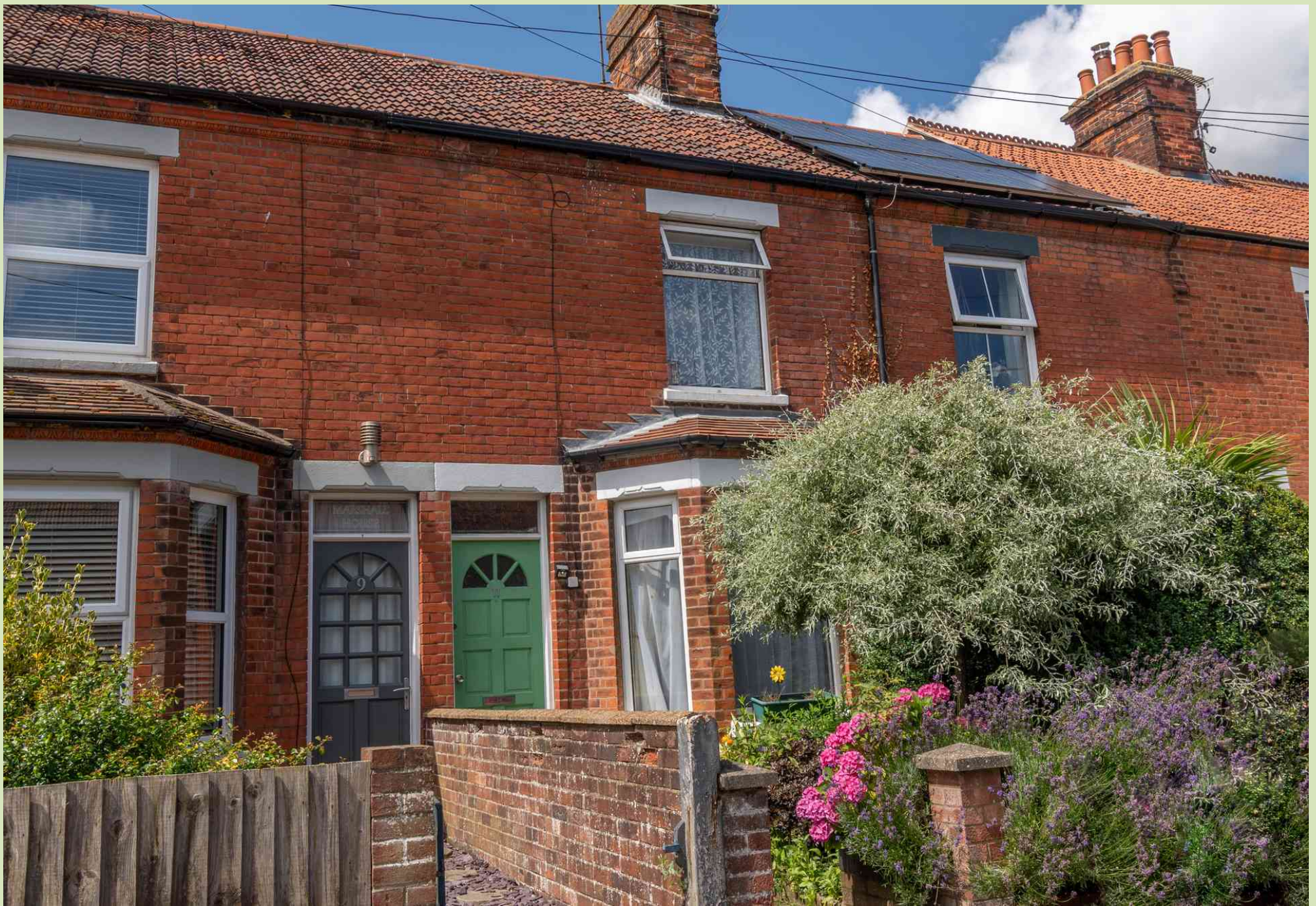
11 Kitchener Road, Melton Constable Guide Price £185,000