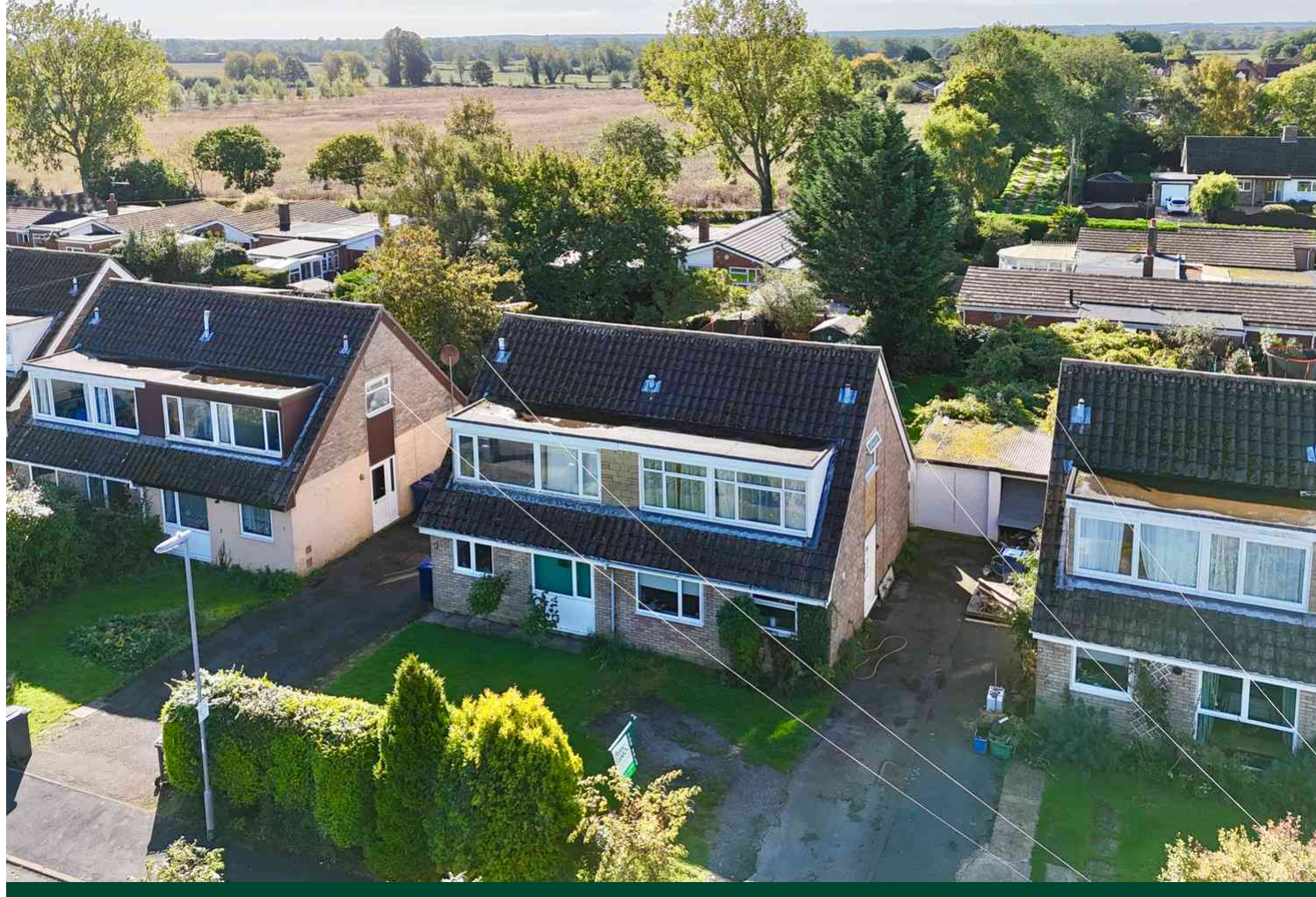
St Johns Close, Needingworth PE27 4TT