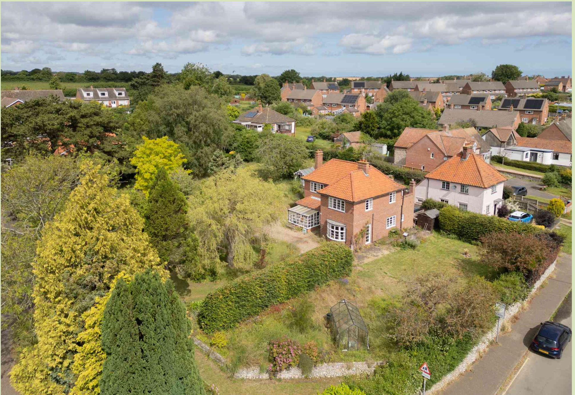
Windsor House, Walsingham Guide Price £640,000