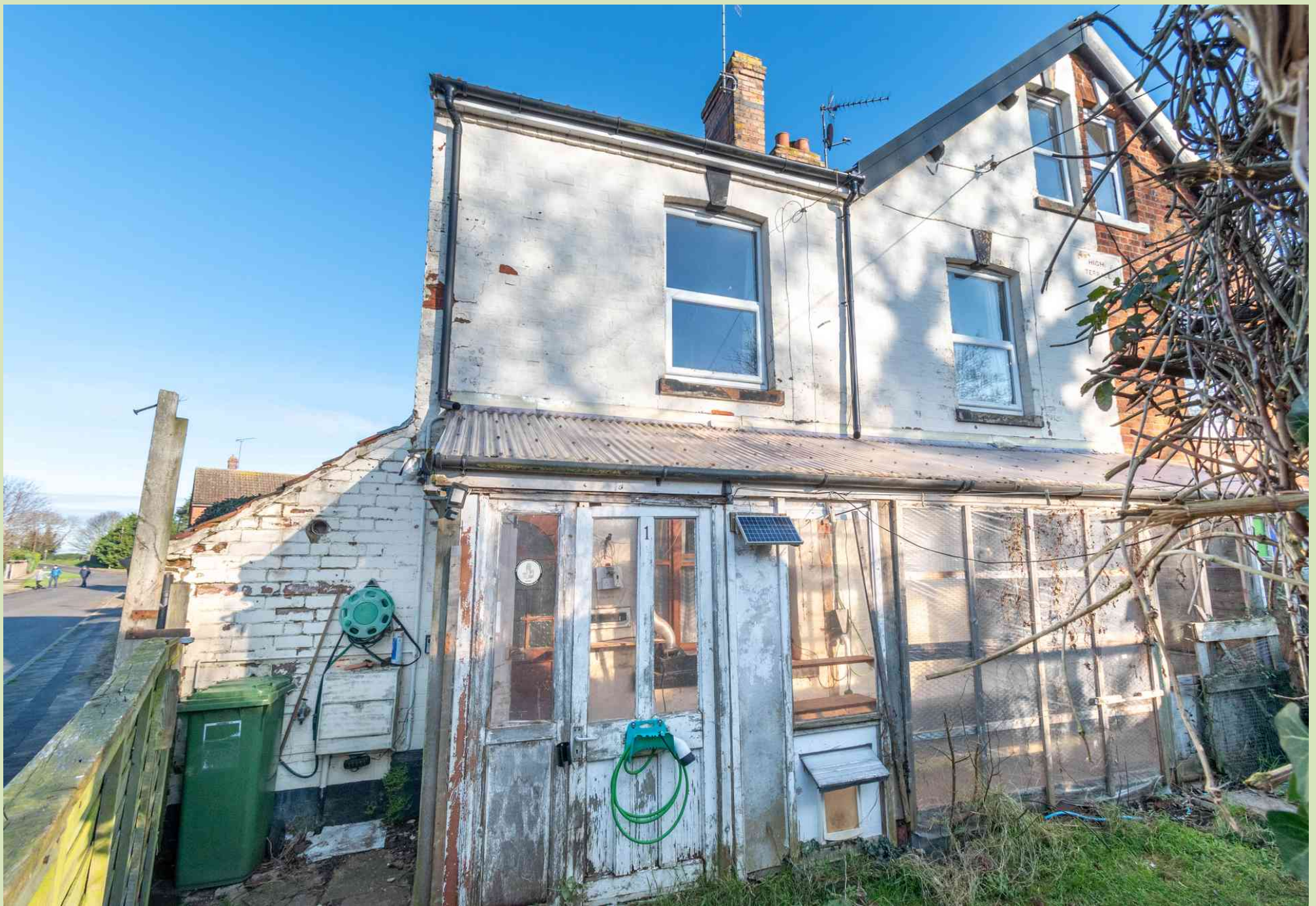
1 High Terrace, Fakenham £150,000